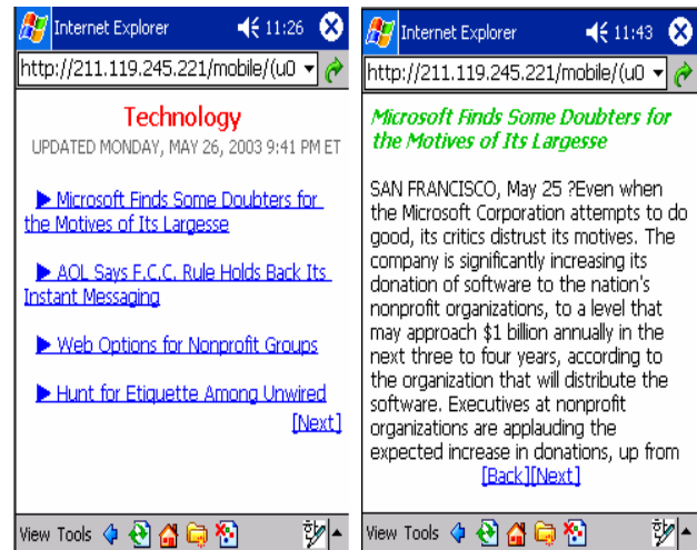
Figure 3. The index page (left-hand side) and the first sub-page of the content (right-hand side)

Notice that the page of Fig.3 has two navigation buttons in the below, instead of scroll bar on the rightmost trail. If we click the Next button, we'll see the 2 nd page of that subject.